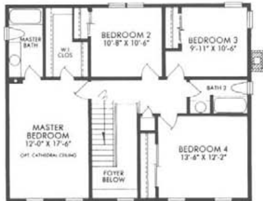
SECOND FLOOR Four Bedroom Plan