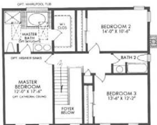
SECOND FLOOR Three Bedroom Plan